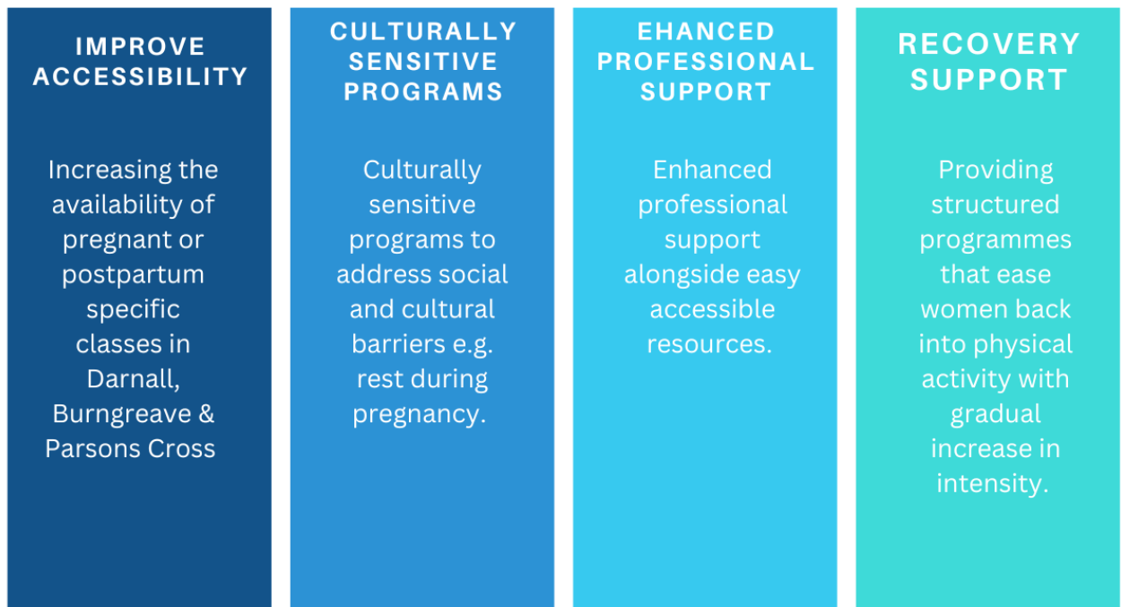
Figure 4: Future recommendations