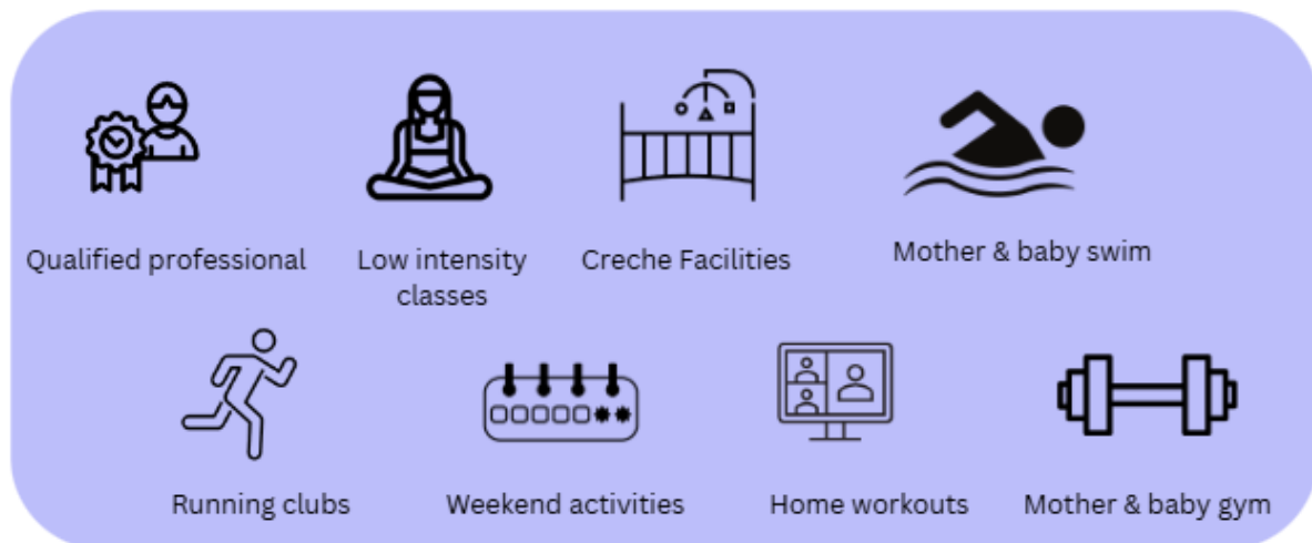
Figure 3: What women want from their physical activity classes